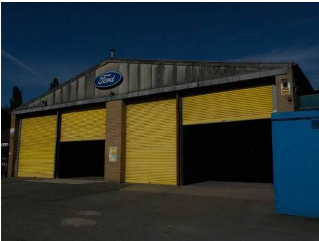
Building 1 – the workshops