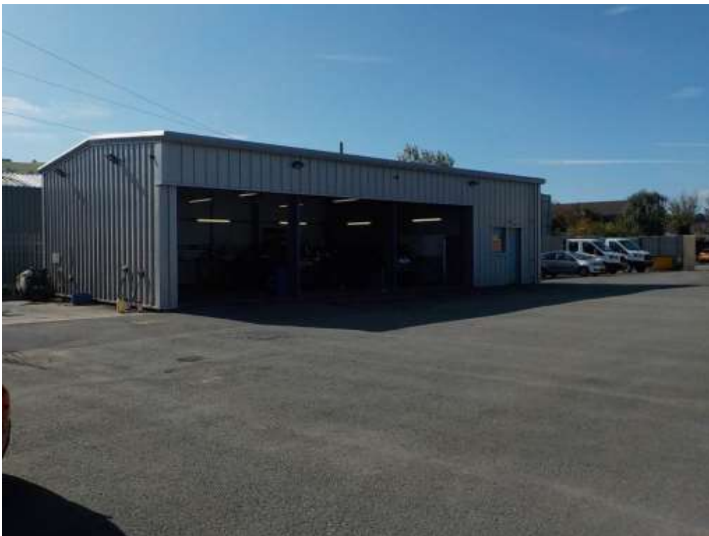
Building 3 – garage workshops