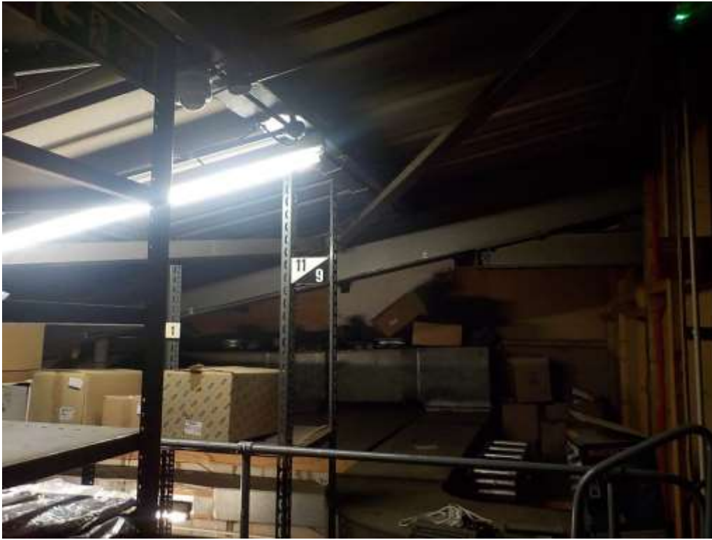
Storage space utilised up to the roof in building 1