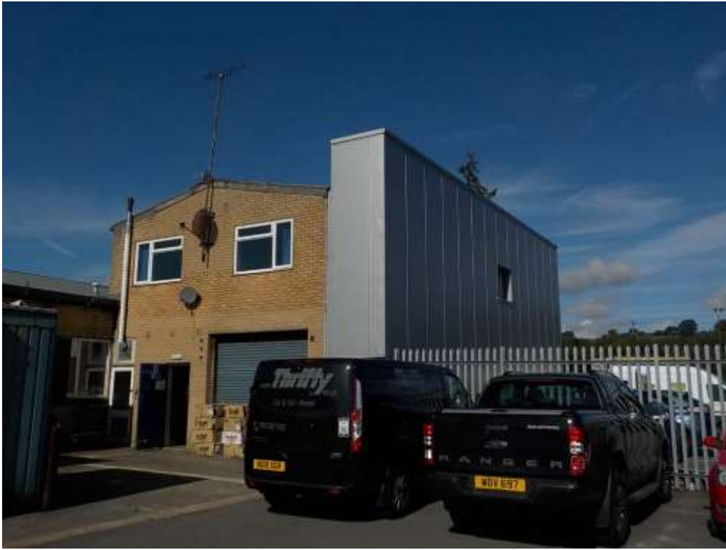
The two-storey brick section