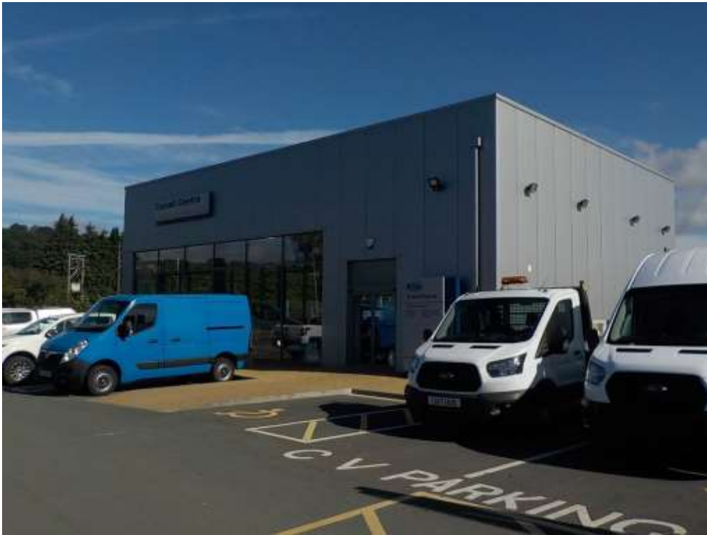
Building 1 – the show room