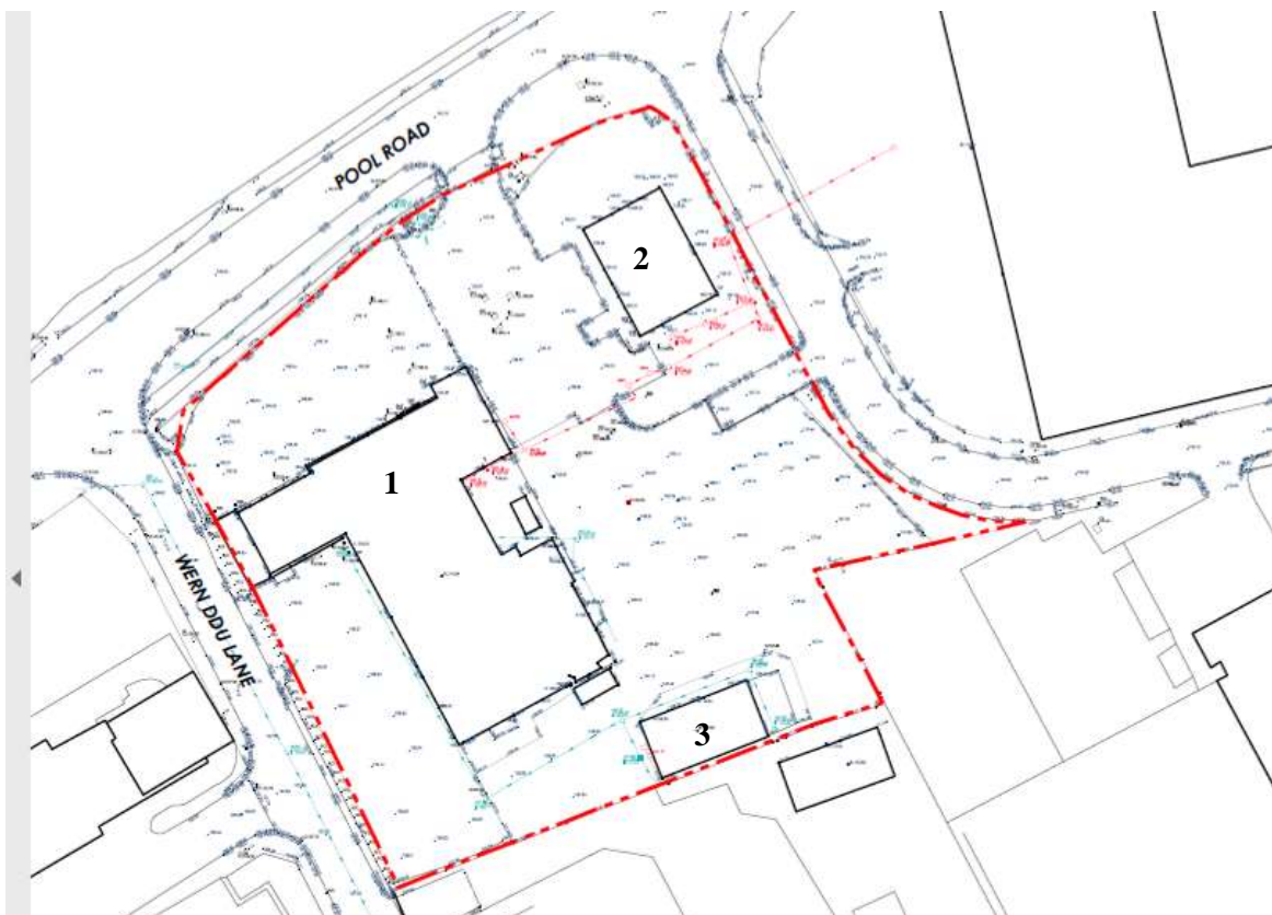
Fig.2: Plan of buildings on the current Greenhous Ford car dealership site