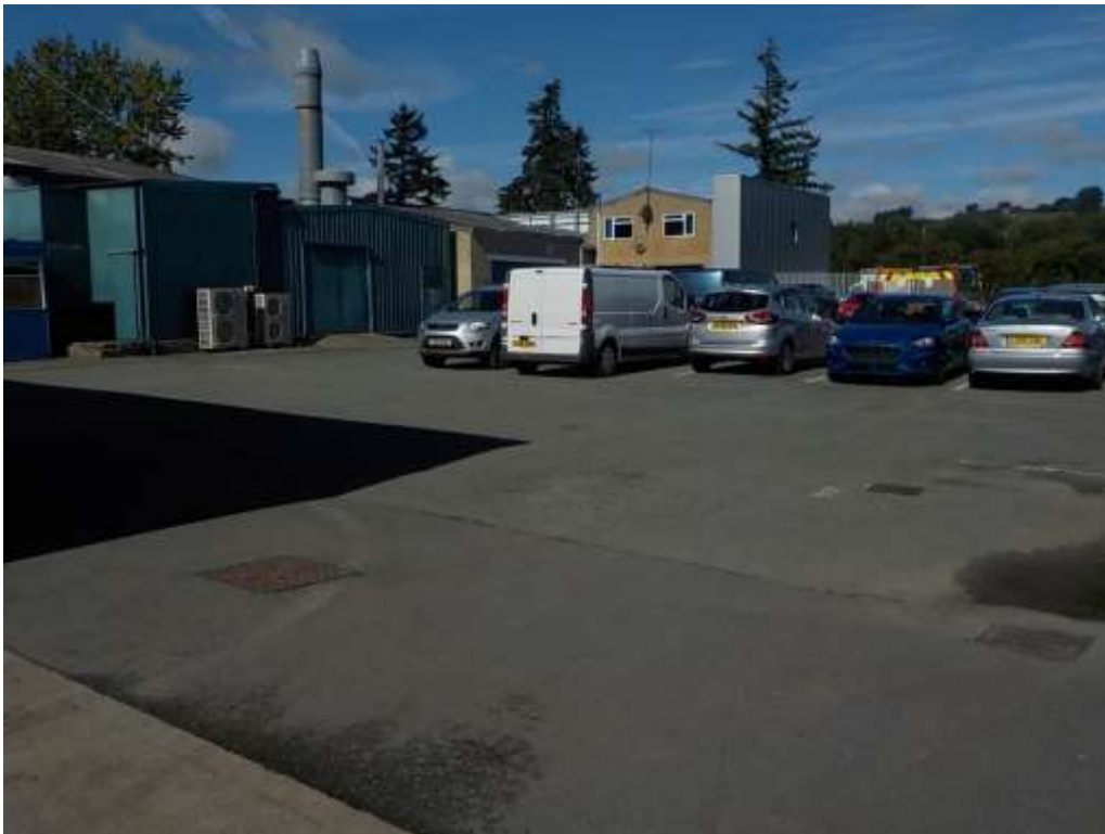
The whole site is comprised of buildings and hard standing